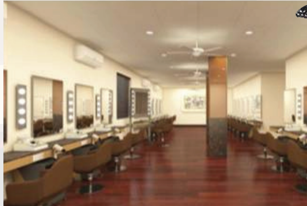
MAKE UP STUDIO